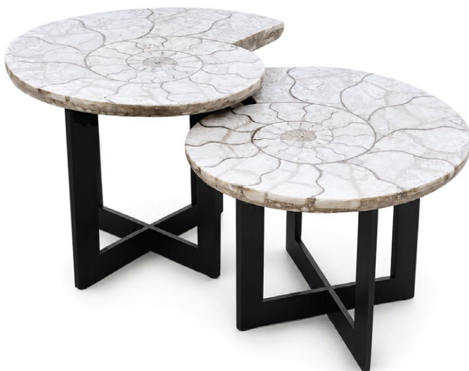
Nesting, Ammonite Top