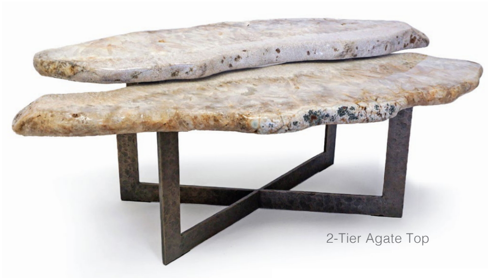
2-Tier Agate Top