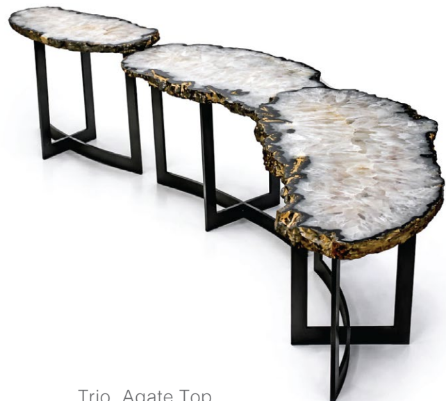
Trio, Agate Top