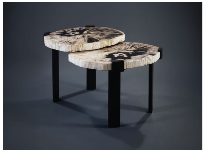
Petrified Wood Top