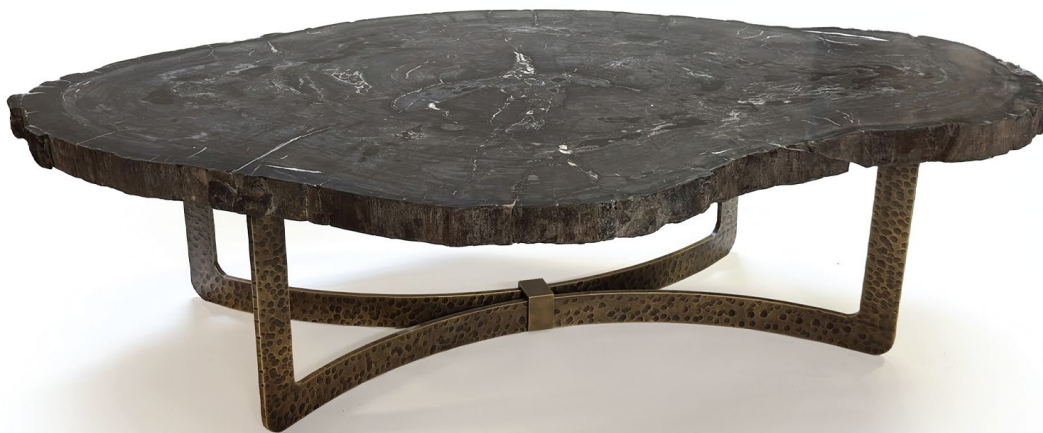
Petrified Wood Top