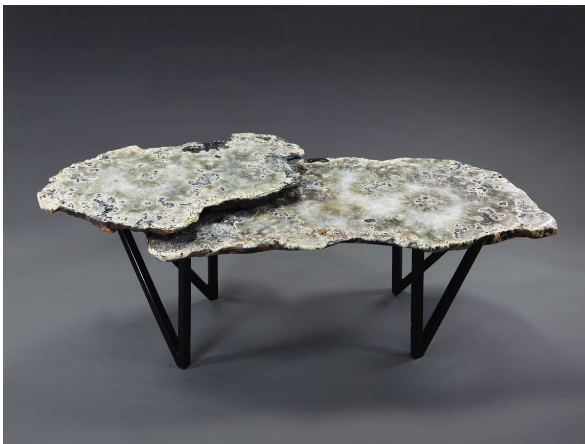
2-Tier Onyx Top