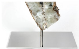
Metal Plate Base