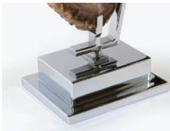
Stepped Metal Base

Acrylic base, Black obsidian base Stepped metal base, or metal plate base