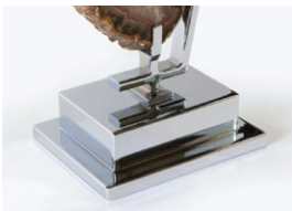
Stepped Metal Base

Acrylic base, Black obsidian base Stepped metal base, or metal plate base