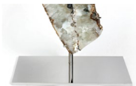
Metal Plate Base