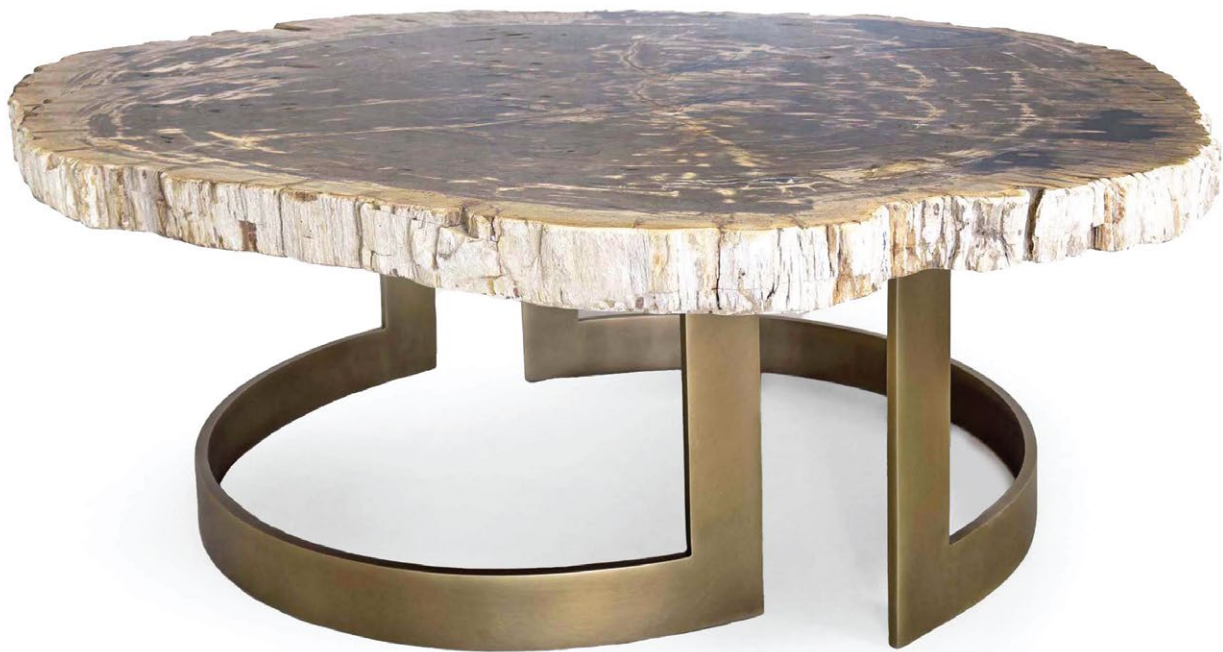
Petrified Wood Top